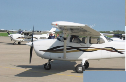
Embry Riddle- Prescott team members preflight a Cessna 172 Thursday